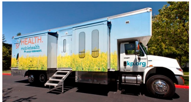
table to provide general health information and answer questions about the plans and how to use the KP app. Two fifteen-minute Zumba sessions will be held the first hour of the picnic and two loterias, with prizes, will be played during the afternoon. Spanish speakers will be available at the van and the table. You do not have to be a KP member to participate. Everyone is welcome!

This year the Kaiser Permanente Mobile Health Van will be at our annual picnic. They will be there from 12:00 to 4:00 providing health screenings for blood pressure, body mass index, glucose, and cholesterol. Flu shots will be available. There will also be an information